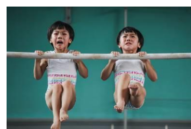
© Tasneem Alsultan / Frederik Buyckx / Yuan Peng, 2017 Sony World Photography Awards

The exhibition will also see the début of the winning, shortlisted and commended work from the 2017 Sony World Photography Awards, the world's largest photography competition. Many of the works in the